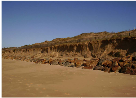
Les dunes ont reculé de plusieurs mètres en arrière des enrochements censés les consolider.

Le recul du trait de côte fragilise cette bande de terre large de moins de 800 mètres, composée pour moins de 300 mètres du