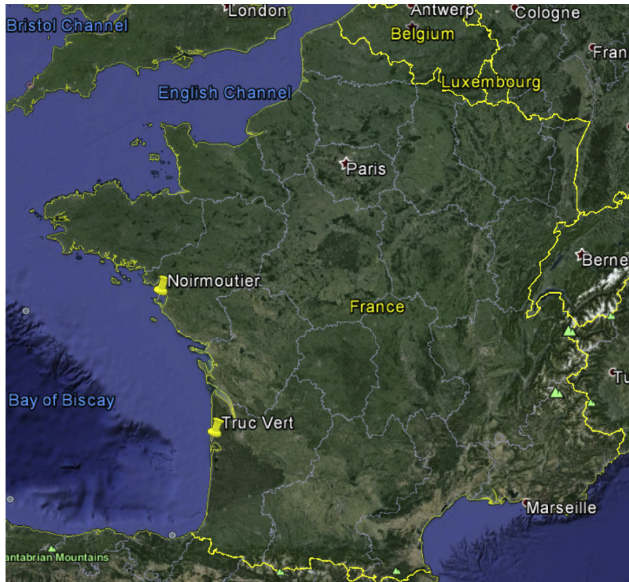
Fig. 1. Truc Vert and La Tresson-Noirmoutier locations on the French Atlantic coast.