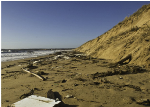
Côté plage, les vagues ont transformé la dune en falaise.

La question financière ne l'arrête pas. « Plus on attend plus le coût des travaux augmentera. Encore quelques tempêtes comme celle-là