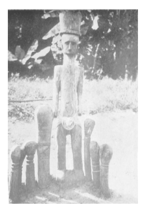
РНОТО 6

of Europeans, two of them wearing a military uniform, one with his honor strip, the other with gallons. In the most ancient and deteriorated statue the drawing of a tie can still be recognized (see photos 7-9). This europeanization of the image occurs equally in its physiognomy, with fine lips, long noses and black mustaches that stand out over the clear painting that represents the skin tone. The contrast with the women's figuration is obvious: the régulo's first wife or namaca (manj.) is portrayed transporting a gourd and a "band cloth" attached by a ceremonial string, usual ceremonial clothes used in several rituals. Besides their clothes, sculptures of the women are painted in a dark tone with African physiognomic lines. One of these icap represents Francisco Mango, a régulo of Caió that was eventually imprisoned in Galinhas island in 1962 (where he would die in 1967), accused of supporting the liberation movements. Before this episode (occuring in a period of strengthening opression that accompanied the raising of the colonial war) there was another interpreter who became a régulo with the support of the colonial administration. In the 1940s, Caió's administrator, Artur Meireles, like his homologue in Costa de Baixo (Babok), was photographed wearing a masculine Western suit, representing the characteristics of European urbanity (Meireles 1949: 17).