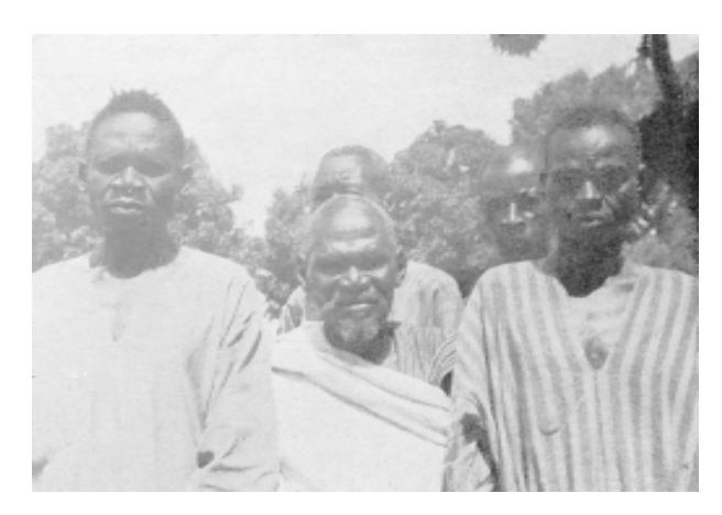
РНОТО 2 – Source: António Carreira, Vida Social dos Manjacos, 1947.

The third picture represents the régulos of Costa de Baixo and Pandim, photographed from a low angle ( contre-plongée ) to emphasize their importance, wearing Western civil suits (see photo 3). The last picture, the only that was not taken in the District capital, portrays a régulo of Pecixe in institutional clothes, including a hat over a scarf, "band cloths" that cross his shoulder, an enormous earring, a collar of the initiates (see photo 4).