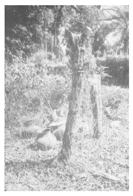
РНОТО 5 - By Clara Carvalho, Jeta, 1992.

with parallel engraved lines (see photo 4), common to numerous libation places in the area; while recent examples are clearly anthropomorphic, varying between the simple evocation of the honored ancestors gender and a complete representation of their physical features. These last representations are today more valuable, as they imply that the payment was made to a local sculptor, which would have increased the costs of the ceremony in whick the icap was placed (see photos 5-6). The icap are installed in the course of a ritual that works as a second funeral (manj.: ussái pesser ; creole: cerimónia di korda ), constituting the final collective homage to the dead that establishes him/her as an ancestor of the house. It is the régulos who are the main characters to be honored in this way.