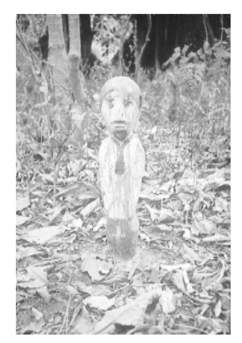
Рното 7 - By Clara Carvalho, Caió, 1997.