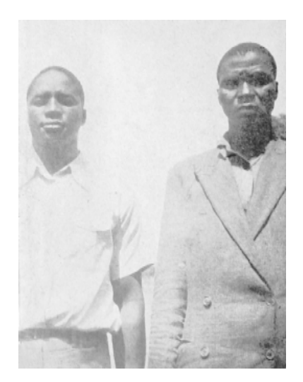
РНОТО 3