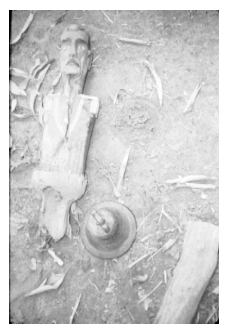
Рното 8 – By Clara Carvalho, Caió, 1997.