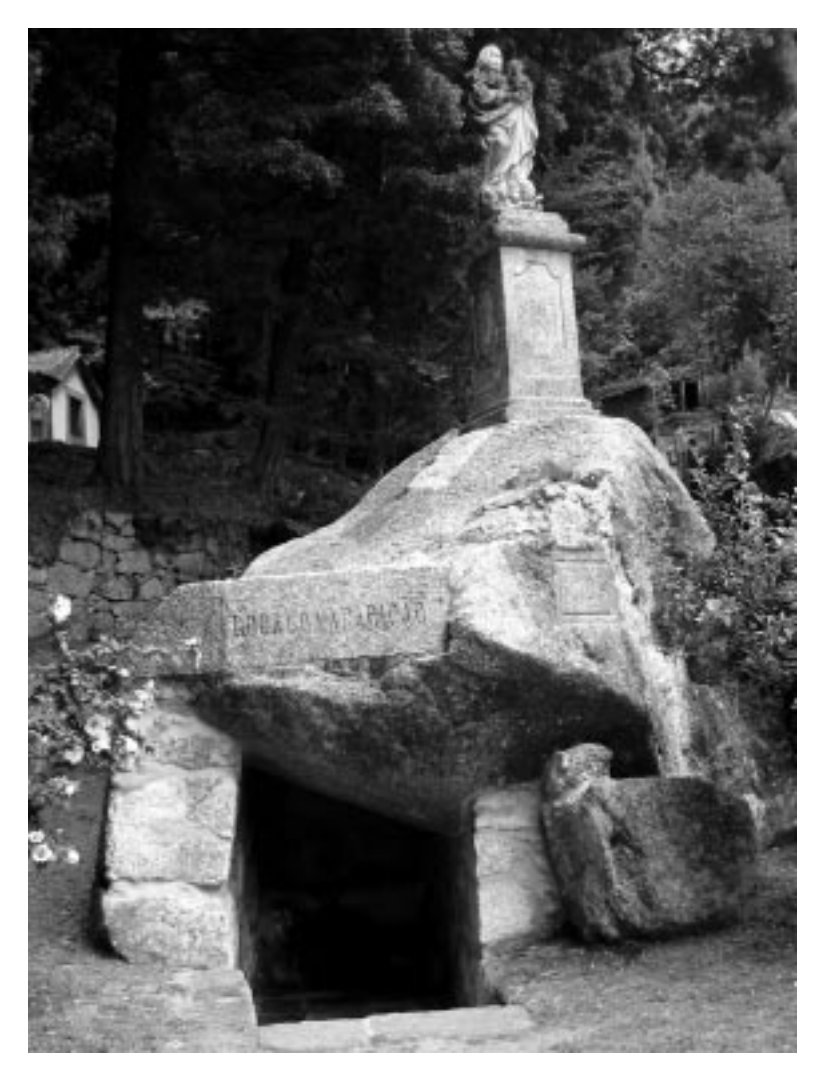
FIGURE 4. Site of the Madonna-and-child statue apparition (Senhora da Abadia sanctuary, Portugal).