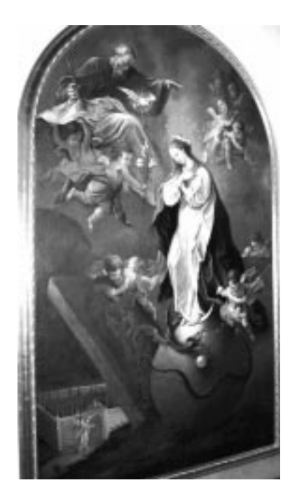
FIGURE 6. Leopold Layer, "The Debt is Paid." 1825 (Slovenian Religious Museum in Stična).