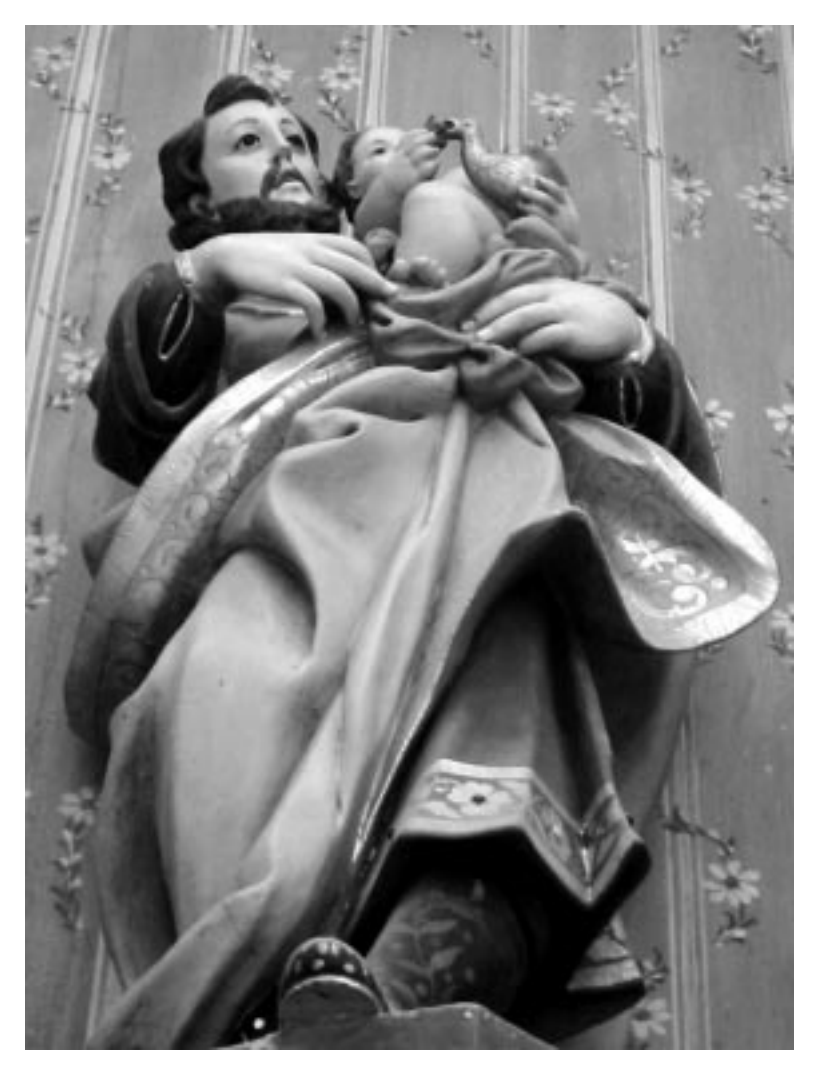
FIGURE 3. Statue depicting St. Joseph and Child with Bird, detail ( Senhora da Abadia sanctuary, Portugal).