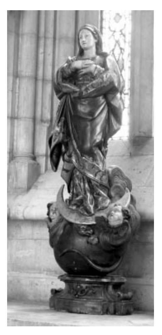
FIGURE 5. Our Lady of Conception (Senhora da Conceição. Lisbon Cathedral, Portugal).