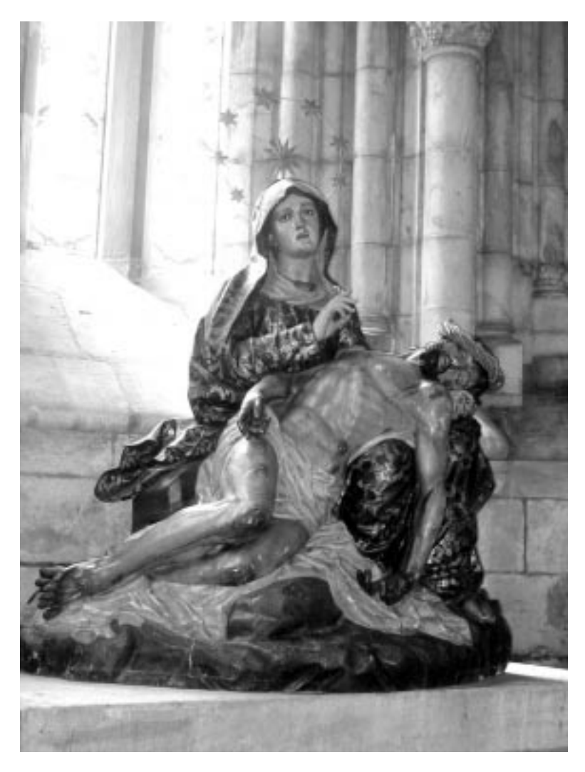
FIGURE 7. Pietà (Senhora da Piedade. Lisbon Cathedral, Portugal).