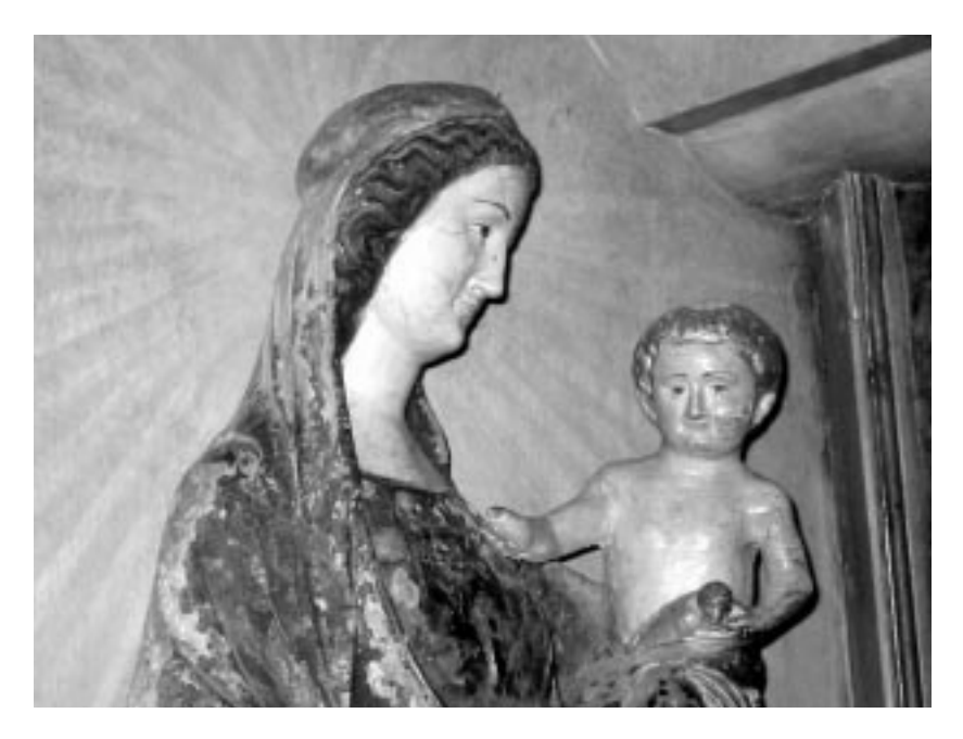
FIGURE 2. Madonna and Child with Bird, detail (Senhora da Abadia sanctuary, Portugal).