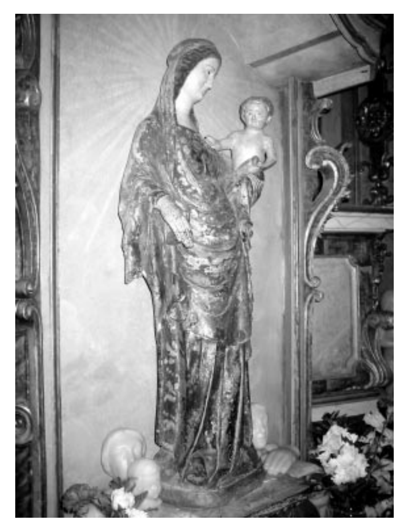
FIGURE 1. Statue depicting the Madonna and Child with Bird ( Senhora da Abadia sanctuary, Portugal).