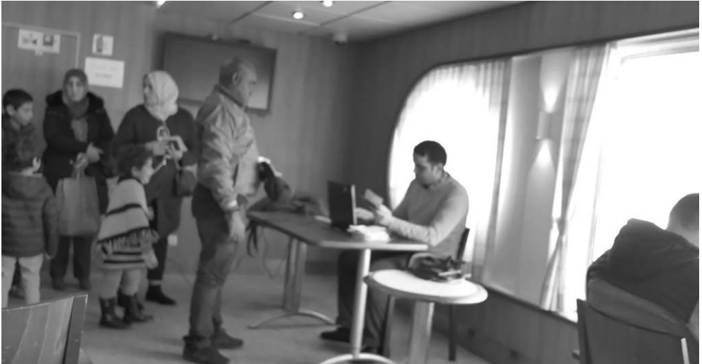
Figure 3 – Across the straight.