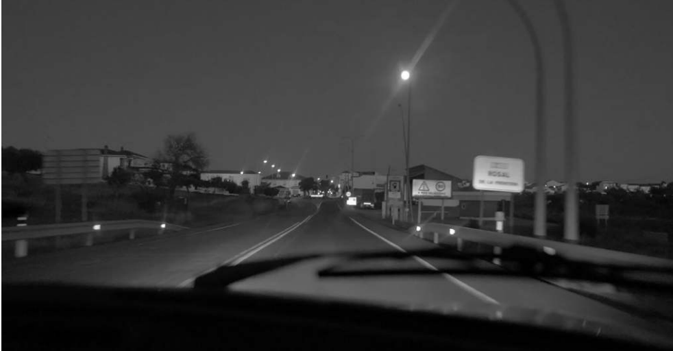
Figure 2 – Border lexicon.