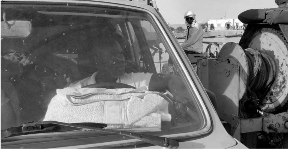
Figure 9 – Border twins.