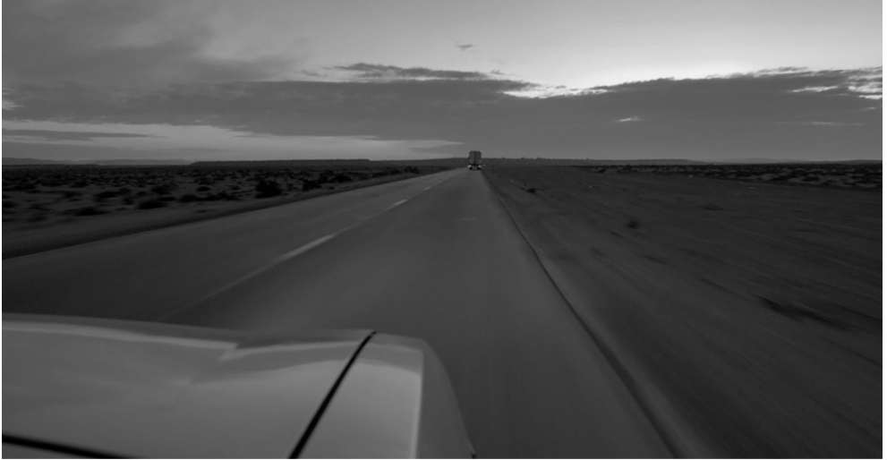
Figure 5 – Invisible lines.