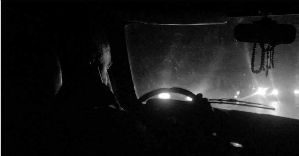
Figure 10 – The border within.