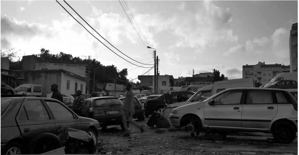
Figure 1 – A Senegalese enclave.