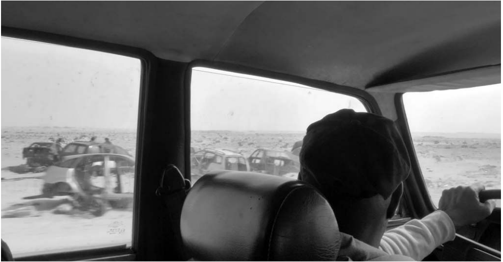
Figure 7 – “Kandahar”.