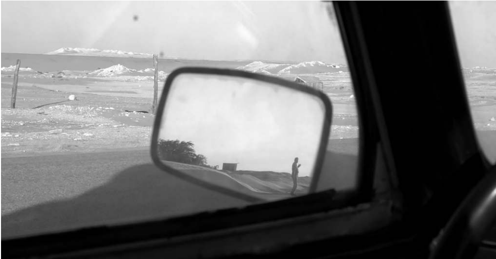
Figure 8 – Travelling border.