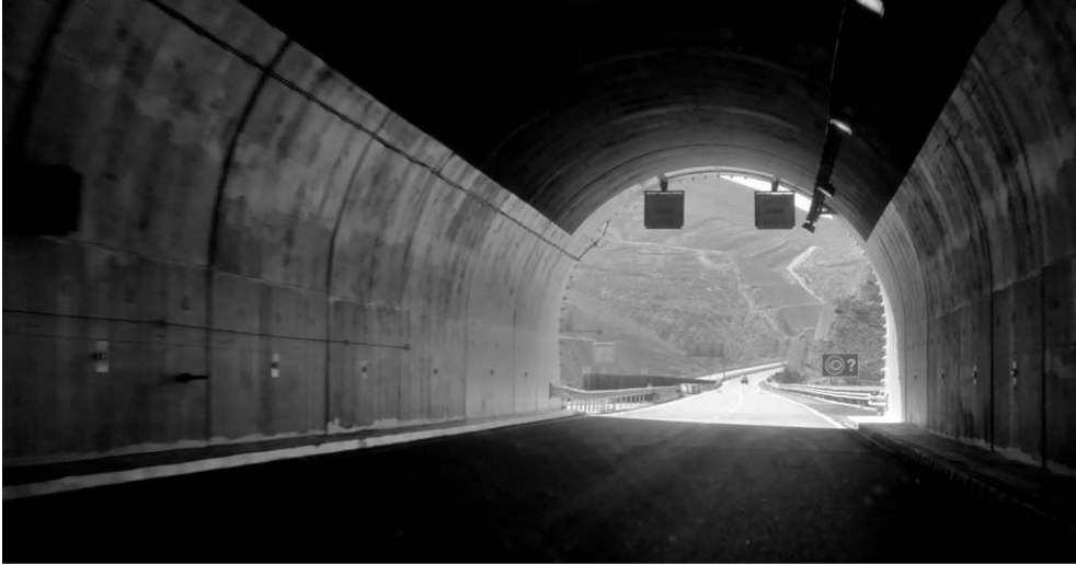
Figure 4 – Mnemonic border.