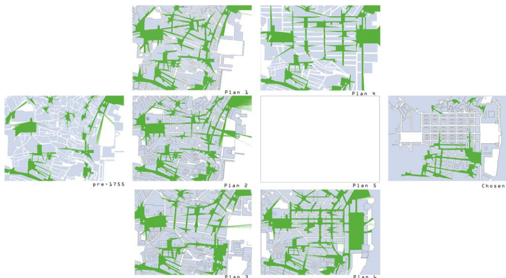
Fig. 3. The isovist constructions for the religious buildings of Lisbon for the different plans as also for the pre-1755 city

These results show that all plans, except the chosen one, had a greater visual impact of churches in public space. This was due to the placement of those churches combined with larger rectilinear streets. In plan 6 this influence was taken to extreme with the proposal of a patriarchal church in Terreiro do Paço . In the opposite direction the chosen plan shows a similar visual impact of churches in the plan as the pre-1755 city. This was accomplished through the removal of all churches from the mains streets and integrating them inside the city blocks. This plan presented a similar level of visual impact, comparable to the pre-1755, but with a completely different approach to the street drawing.