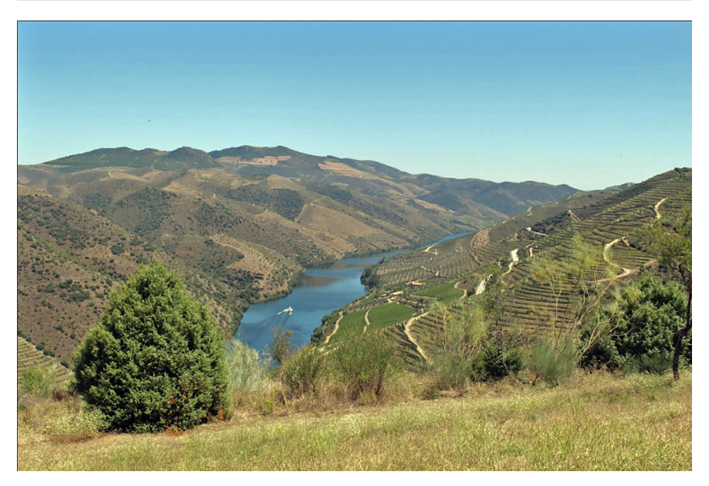
Fig. 2. Landscape of the Douro Demarcated Region

accommodation (LA)<sup>2</sup>, rising from 472 lodgings in 2019 to 1022 in 2024. As for tourist enterprises, the number rose from 246 in 2019 to 308 in 2024 (Turismo de Portugal, I.P.<sup>3</sup>). Tourist entertainment agents also increased from 112 in 2019 to 215 in 2024. In contrast to these increases, travel and tourism agents remained virtually stable in the region, with only a slight decrease from 47 to 45 and they are mainly concentrated in the main urban centres (Vila Real, Lamego, etc).