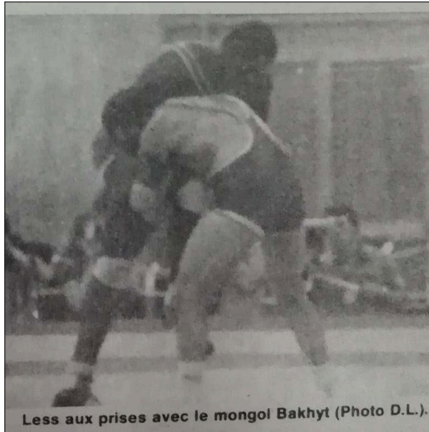
Figure 2: Double-Less wrestling in the 1980 Olympic Games