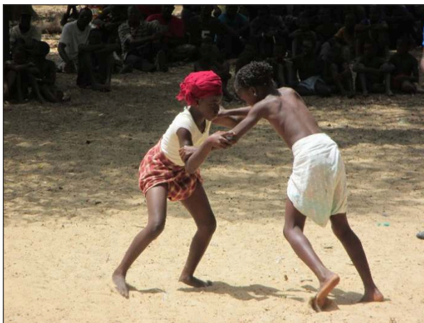
Figure 6: Girls also wrestled at the Festival of the Rice Field in Diembering, April 2014