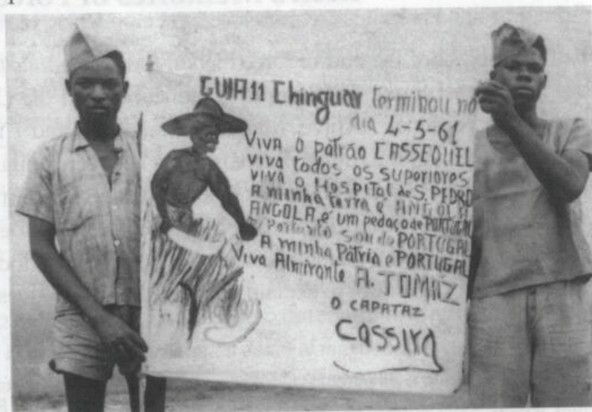
Chinguar Guia.

There was certainly an element of theatre involved in the group interviews. In nearly all the villages we set up a table, on which sat the tape recorder, and chairs. I often thought about « what it means to stage oral histories? » 14 . Did the performative aspect of the group interview presuppose how interviewees would answer? To begin we always explained, in Portuguese and in Umbundu, the objective of the group interview: « to learn about migrant labor from the 1940s and 1950s ». I explained that we were working with the National Archives in Luanda, and that I had written a dissertation on the subject of labor in colonial Angola. As my dissertation was passed around, I told of my research in the National Archives and pointed out several reproduced photographs of contratados taken at the Sociedade Agrícola do Cassequel in Catumbela in 1961, just weeks before the 2 May 1961 abolition of the Estatuto do Indigenato . These photos, such as the one below, jump-started our conversation. I asked interviewees their reactions to the messages on the banner being held by contratados in the guia from Chinguar: « My land is Angola. Angola is a part of Portugal, hence I am Portuguese. My fatherland is Portugal ». Most people simply laughed and shook their heads. The photo was then usually passed outside the immediate circle of mais velhos to younger men and women sitting on the outside the circle to hear their elders speak of the past.