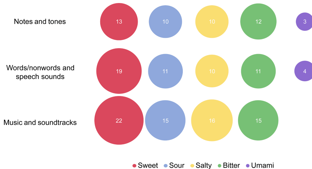
Fig. 2. Number of Studies Examining the Correspondence Between Each Basic Taste and Various Categories of Sounds.