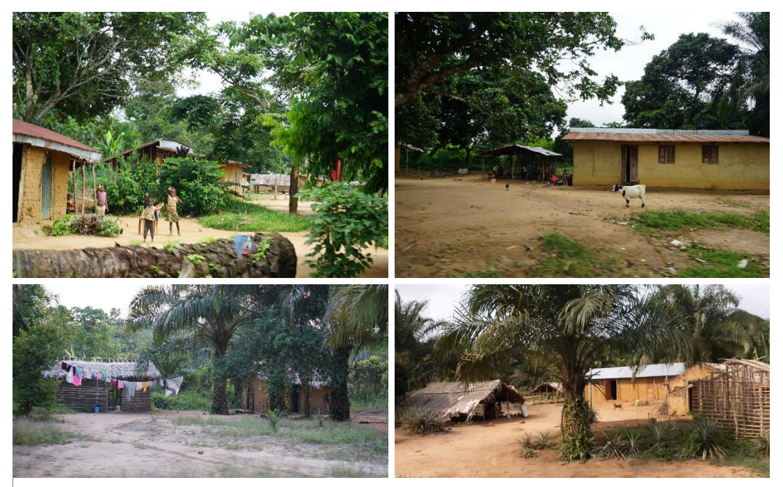
Figure 2.7 | Houses in the village of Mbomo (Inês Caetano, 2021).

Mbomo is a rural village located in northern Congo, on the outskirts of Odzala-Kokoua Park and home to around 7000 people. Etoumbi is the closest small town to Mbomo, it is 63.2 km away. Brazzaville, the capital where the main hospitals and services are located, is 723 km away from Mbomo. Mbomo is a remote village, without electricity and potable running water, where there is one central market for the population to go to buy food, a police station, schools, including Sanza Mobimba and one hotel. On the streets you can see wild animals that often enter the village, including elephants, causing some conflicts between the villagers and these animals or hyenas. The families are quite large and manly composed by youth members and live in small houses built with mud and straw. In order to survive, women travel for miles every day in search of mixed amounts of water, water that is not drinkable and often causes health problems for those who consume it, as is the case with cholera. It is common to see plantations and small vegetable gardens, mainly of saka saka , the leafs of manioc a very famous vegetable and much appreciated by the inhabitants of the Republic of Congo, where communities grow