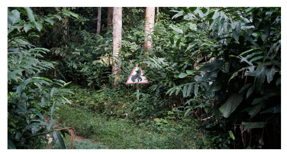
Figure 2.4 | Sign in the road to Ngaga camp informing about gorilla presence.

After the Ebola outbreak in Congo between 2000 and 2002, the team was afraid of human contact with the gorillas, and it was always mandatory to wear masks and undergo medical