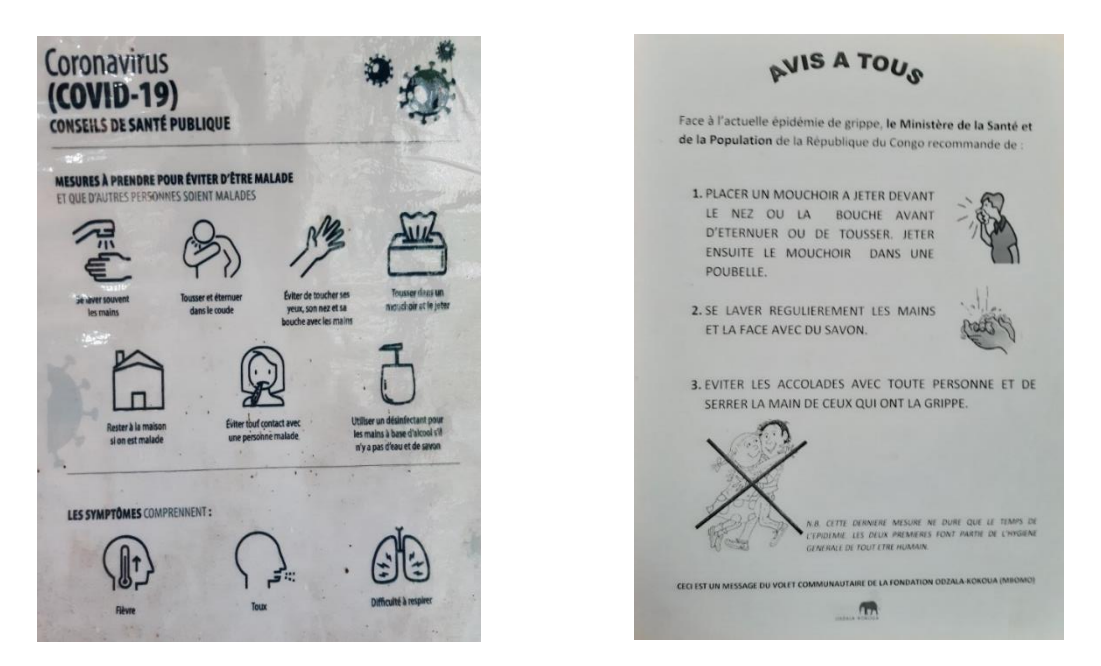
Figure 3.1 | COVID-19 informational fact sheets (Inês Caetano, 2021).

The fact that humans are increasingly closer to habitats and wildlife, increases the probability of transmission of viruses from animals to humans such as COVID-19, Ebola, harming human health and putting it at risk biodiversity. There will have to be a great deal of respect and awareness for wildlife so that there is a balance and it is possible to conserve and mitigate the inherent dangers for the communities and animals.