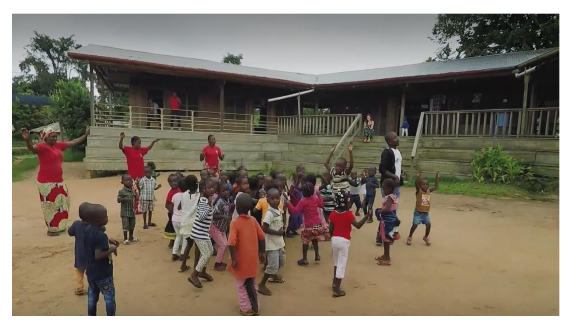
Figure 2.6 | Activities in Sanza Mobimba (SPAC, 2020).

The purpose of the Early Childhood Development Project, created in 2013, is to promote a sense of environmental responsibility in children from an early age. This promotes the theme of the environment in the family. Children at home often talk to their parents about what they have learned and talk to each other. The focus areas of this project are the Odzala-Kokoua and Nouabalé-Ndoki national parks in the remote northwestern regions of the Republic of Congo. The main community center, Sanza Mobimba, in Mbomo village, on the outskirts of Odzala-Kokoua National Park, was founded in 2013. Building on the success of the Sanza