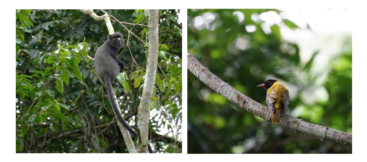
Figure 2.1 | Biodiversity in Odzala-Kokoua National Park. Cercopithecus nictitans on the left and Oriolus Larvatus on the right (Inês Caetano, 2021).

In the Congo basin, there are about 10.000 species of tropical plants, more than 400 species of mammals, 1000 species of birds and about 700 species of fish. In addition, it is also home to the largest population of lowland gorillas, with around 7000 individuals (Cesareo et al., 2012).