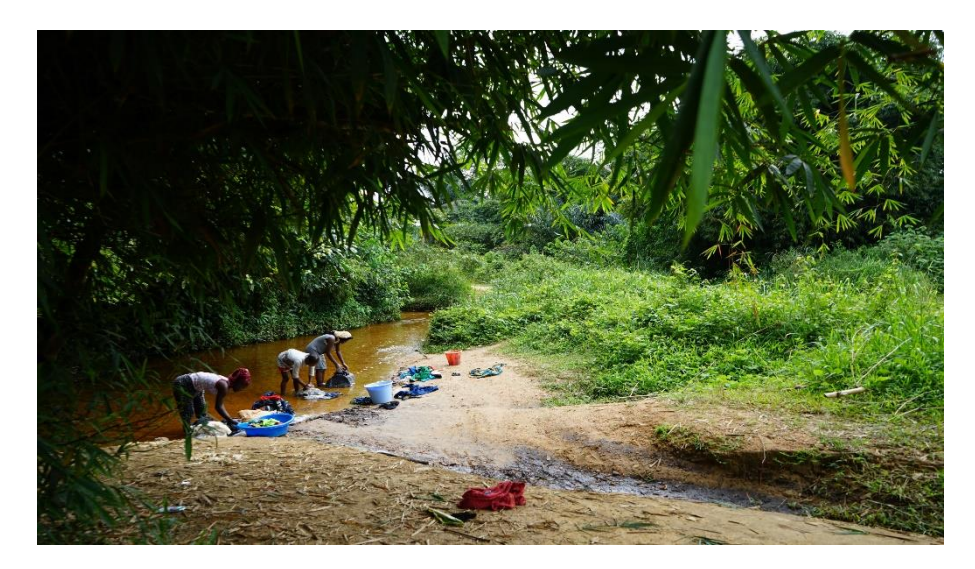
Figure 2.8 | Women washing clothes in the river stream in Mbomo (Inês Caetano, 2021).

The daily activities of the community are associated mostly with subsistence, being the market, the central place of the village and the river stream the place to wash clothes. Despite most of the people in the village spoke the regional first language Lingala , a second language was also used, Mboko . On the other hand, some were able to speak French, the official language of the Republic of Congo.