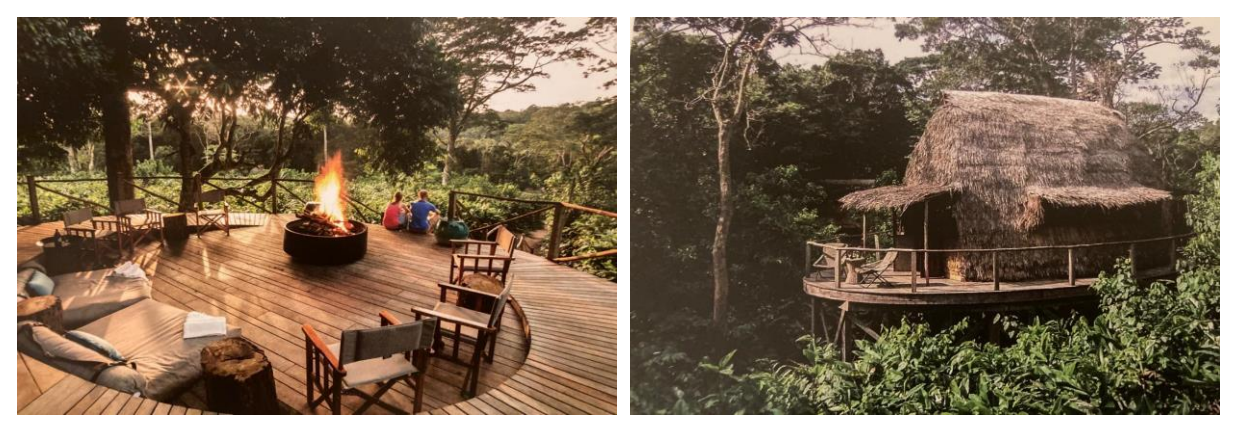
Figure 2.4 | Lodge and rooms at Ngaga camp (Vande weghe, 2017).

Sabine Plattner is a private citizen who is doing work in conservation in and around the park (in support of the Park Management). She created in 2008 two separate structures, on the one hand, the Congo Conservation Company (CCC) which is a private tourism company and on the other hand, Sabine Plattner African Charities (SPAC), which is a charity, a non-governmental organization that does education and research in support of conservation. SPAC acts in three different projects: Early Childhood Development (ECD), EduConservation and Conservation & Research (located in Ngaga camp). The CCC is responsible for managing the camps, both locally and from the Brazzaville office where most of the goods and necessary equipment are sent. The focus of the work of these organizations is the community of Mbomo, which despite being far away from the country's capital and main resources, is well supported by these organizations.