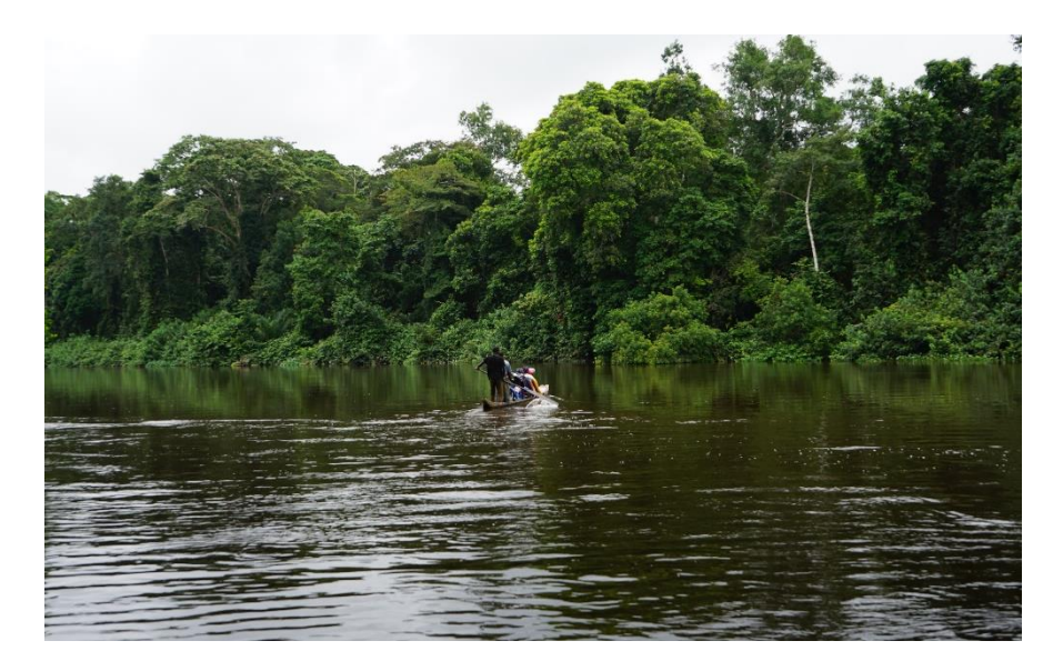
Figure 2.2 | Crossing the Likouala-Mossaka river to take the path to Odzala-Kokoua National Park.

The future of Odzala depends on the communities that live around the park and are essential to its conservation and preservation. For this reason, and because communities also depend on the park's well-being to survive, focus is given to various community projects, both on the side of African Parks and SPAC, and even together. The organizations, as well as the Congo Conservation Company, work with the Mbomo community in development projects in and around the park, and a large part of the organizations' team is made up of Mbomo