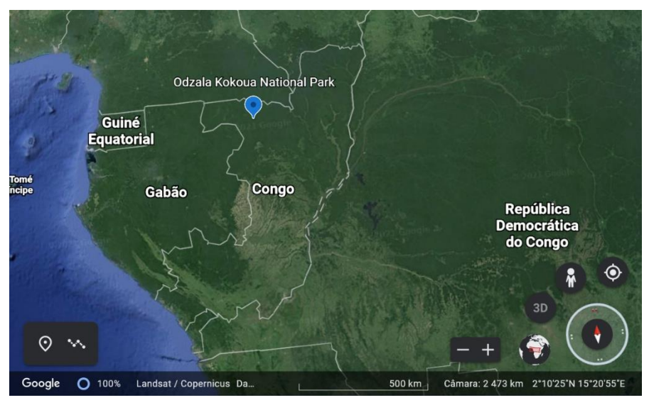
Figure 1.1 | Location of Odzala-Kokoua National Park.

About 10.000 people live in the surroundings of Odzala-Kokoua National Park and are increasingly involved in sustainable development projects around the park. In the Odzala-Kokoua area, a community project, Odzala Foundation, was created by a partnership between African Parks Network (APN), the Congolese Government, and members of the Mbomo community, comprising three eco-development zones, in which agroforestry and consumptive