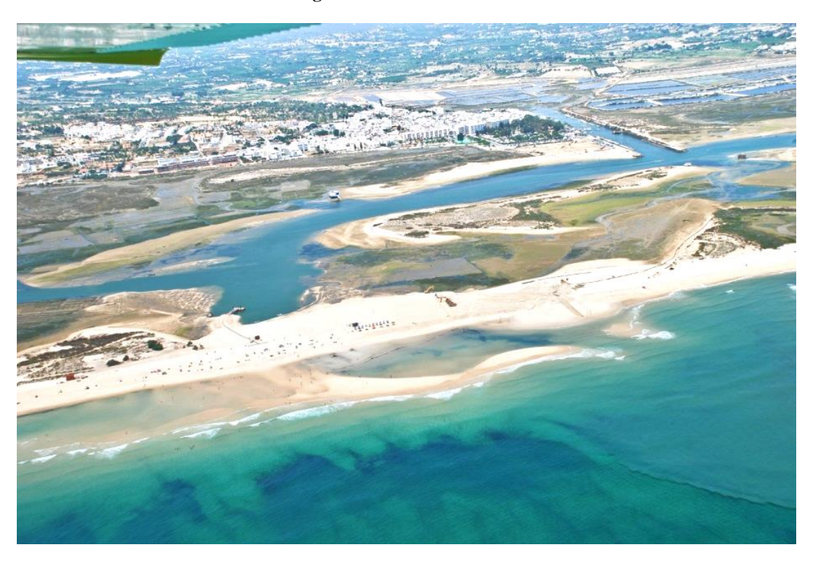
Figure 2. Fuzeta aerial view

Since the 1980s, the Algarve has become Portugal's favourite holiday destination, for both nationals and foreigners. Consequently, in the last four decades, the active population has shifted from the primary sector to activities directly or indirectly related to tourism (Instituto de Conservação da Natureza e das Florestas [ICNF], 2018).