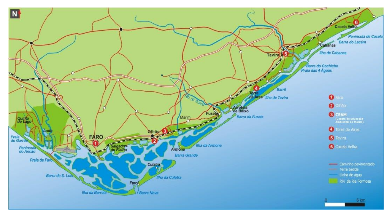
Figure 3. Map of Ria Formosa

Ria Formosa is a salt water lagoon in the eastern Algarve covering an area of 18,000 Hectares that extends from the municipalities of Faro, Loulé, Olhão, Tavira, and Vila Real de Santo António (ICNF, 2018). It is bound to the north by the coastline, which includes salt pans, sandy beaches, agricultural land, and freshwater lines (Caldeira, 2015), and to the south by a sandy dune cord, consisting of a set of islands parallel to the coast, interrupted by six inlets – including the Fuzeta inlet – that allow the entry and exit of seawater and boats (Figure 3). It is the most important wetland in the South of Portugal and, since 1980, it has been on the list of Wetlands of International Importance (Perna, 2005). It has an enormous ecological, scientific, economic, and social value. It includes several habitats, and its biodiversity is internationally recognised (ICNF, 2018).