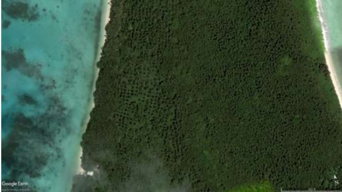
Figure 2. The gridded fields of coconut palms north to East Point, Diego Garcia (2016)