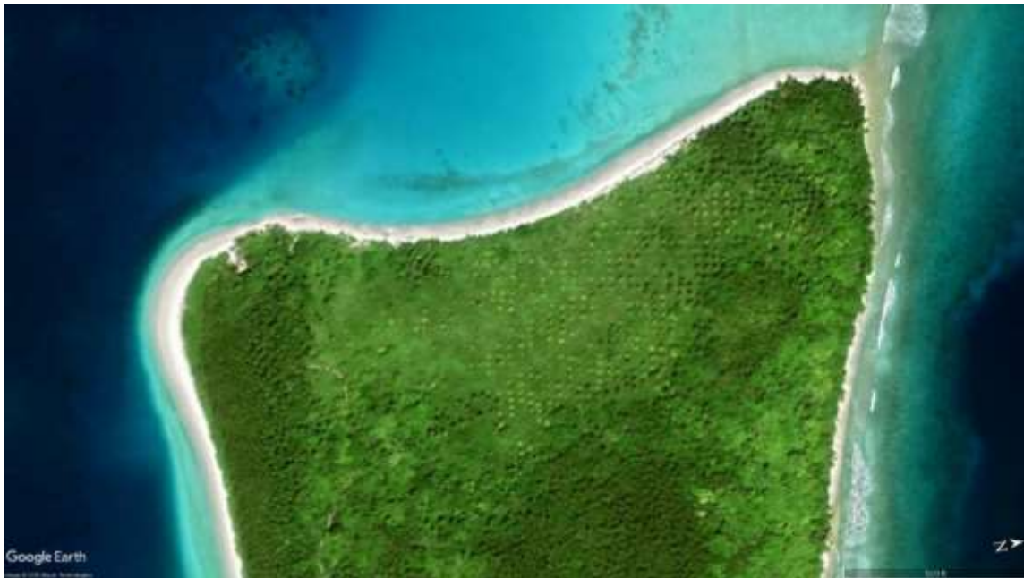
Figure 3. The gridded fields of coconut palms stand out from lower hardwood populations at Barton Point, Diego Garcia (2016)