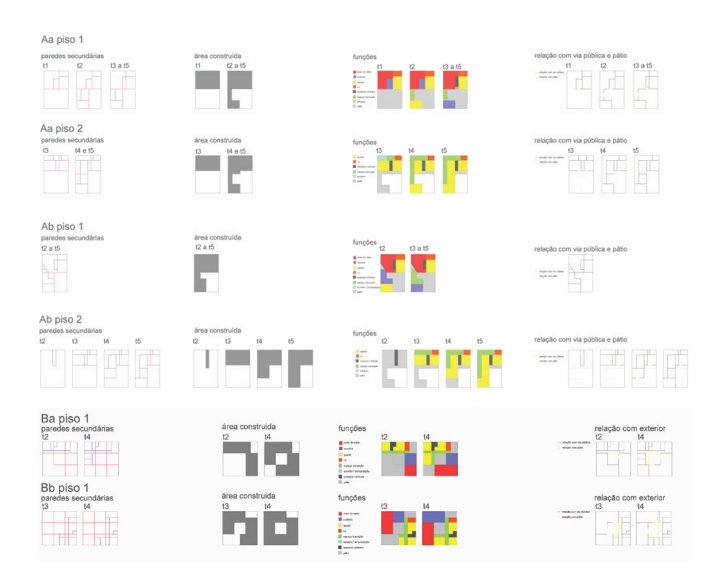
Figure 1: Case-studies analysis.

generative parametric computational methods and digital fabrication that allows a more qualified and easier to control custom mass production, with benefits both for authorities and inhabitants.