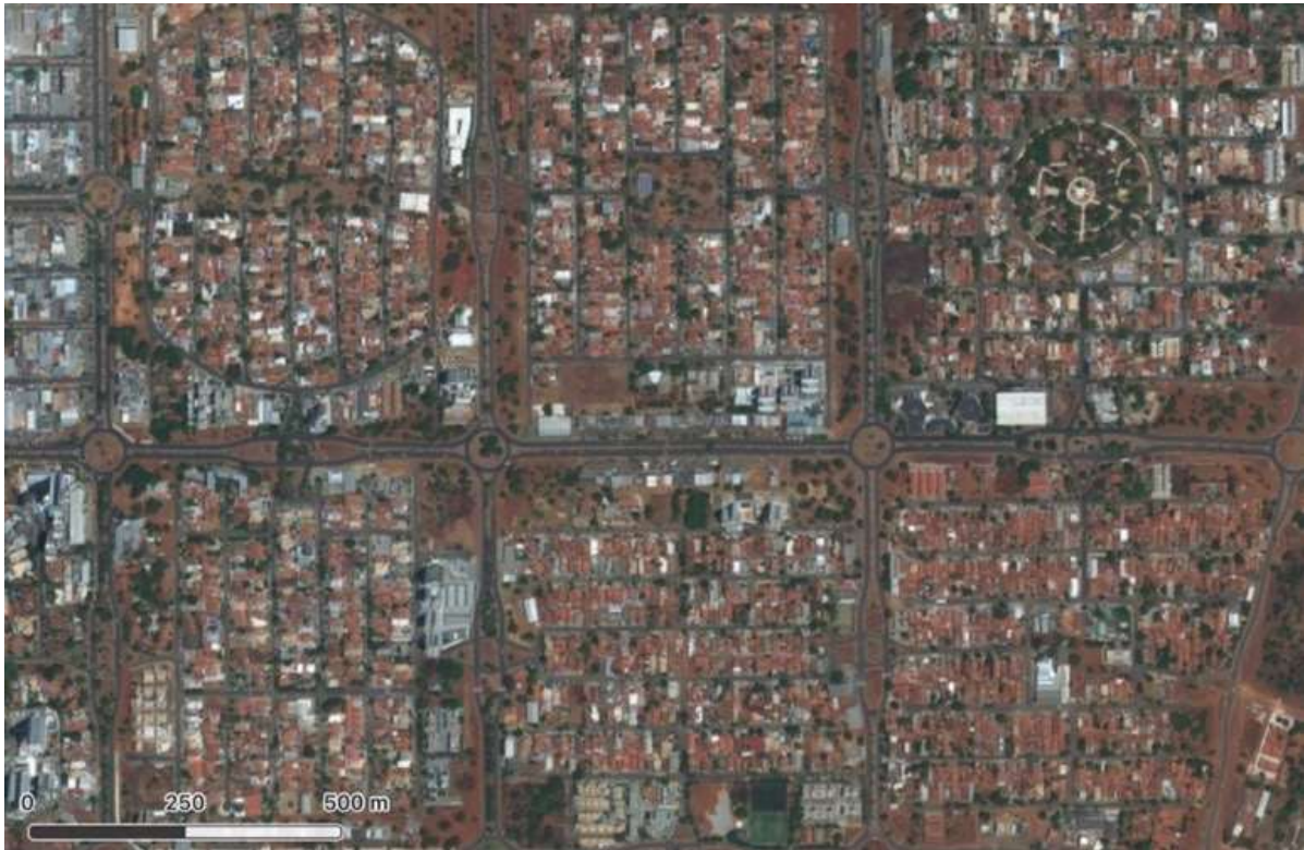
Figure 6. Palmas residential area

6). The neighbourhood unit was once more adapted and tamed into a local modernization process, as in Abuja (Lu, 2006). Palmas' neighbourhood units are another legacy of the modernist urbanism and the Americanization of Brazilian cities, insisting on a planning scheme that had long been contested in favour of more urban diversity (Rego, 2019; Rego, 2017; Jacobs, 1961). Unlike Brasília, though, each of Palmas' macroblocks individuality was to be enhanced through a unique internal urban layout and design. The macroblocks' diverse inner form avoided the modernist uniformity, though it lacked legibility and has created a puzzling urban image. Some macroblocks present a grid pattern, while others present an informal layout of winding roads.