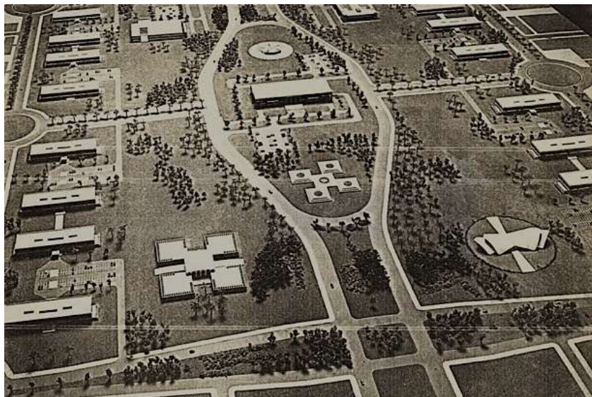
Figure 5. Teixeira and Oliveira Filho's original plan for Palmas civic centre, 1989