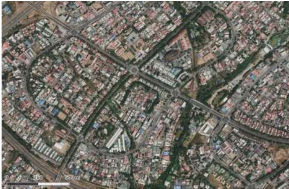
Figure 2. Abuja residential area

between 40,000 and 60,000 people each. Districts were then subdivided into communities defined by curvilinear streets. Like the sectors, districts and communities were to have their own centres, intended to be self-sufficient. The sector centre was located along the transitway system to facilitate accessibility, and it was meant to be self-contained concerning to commerce, public services, post-secondary and special education facilities, hospitals, and a library. According to a Nigerian architectural historian (Elleh, 2017, pp.175-176), the neighbourhood-unit concept underlies the community organization and the scale suitable for provision of many household-related services; its centre should contain a church, mosque, primary schools, market and shops, health clinic, post office and police station (Abubakar, 2014, p.84. Figure 2).