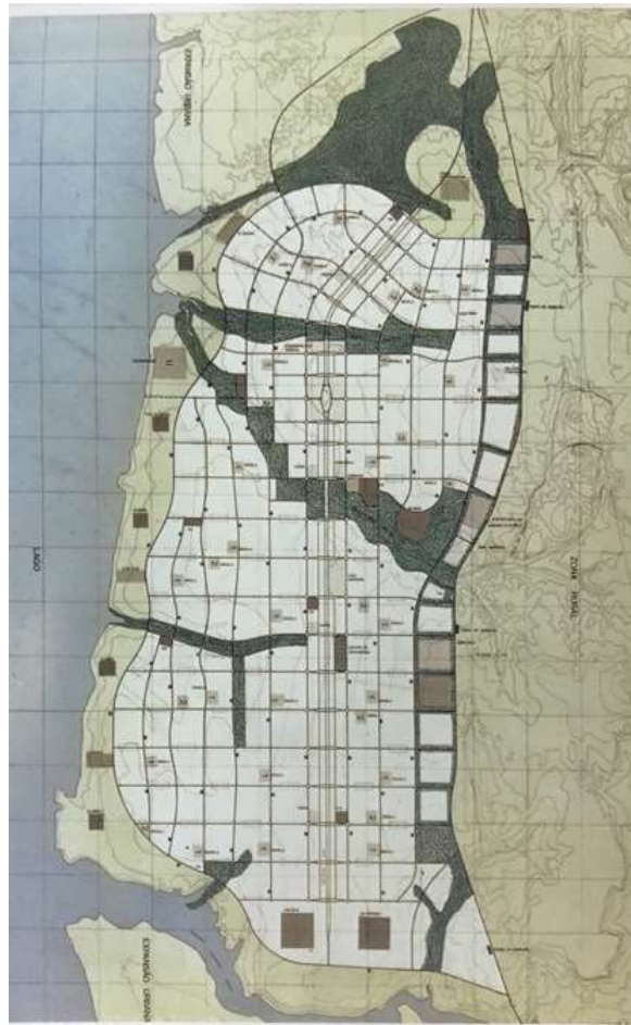
Figure 4. Original plan of Palmas, 1989