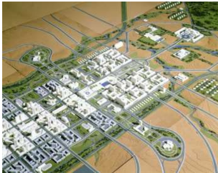
Figure 3. Kenzo Tange's plan for Abuja mall and the civic centre, 1981