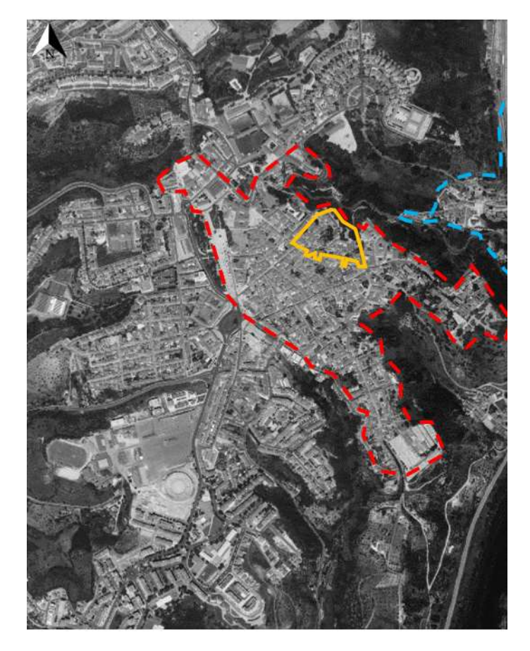
Figure 1. The Mouraria (outlined in yellow) in the context of the wider city of Santarém

The paper proposes that historic centres of settlements are imbued with special meaning and significance and that their pronounced decline can be reversed in such a way as to enable the re-establishment of balanced communities. This is based on an integrated approach to planning and conservation policy, permissible under existing national legislation, and very much in keeping with European spatial planning theory and practice. Whilst other routes could exist, the paper proposes that the HUL approach is most compatible with recent planning and geographic theory and that, tailored to local contexts, it can provide a resource-efficient and collaborative pathway to the delivery of effective and bottom-up policy. It is certainly preferable to the current inertia in the local management of many historic environments. The focus of the empirical component of this paper is at the evidence-gathering stage of policy production as a grounded bottom-up critical exercise, to demonstrate how HUL approach principles could make this more reliable, robust and democratic. Such an approach is in line with the move in national and EU planning policy away from a regulatory and towards a process-led approach to the built environment.