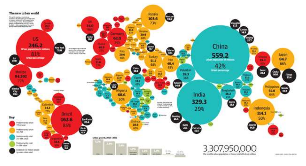
Figure 3. World urbanization graphic

In recent years, the world in general, and Brazil in specific has gone through a rapid process of urbanization (Figure 3) (Gobbi 2016; Vidal and Scruton 2007).