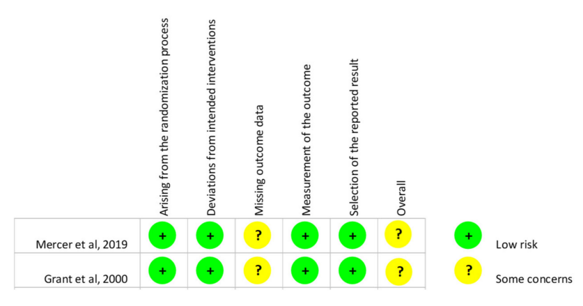
Figure 2. Quality assessment for randomized controlled trials (RoB 2.0) [38].

None of the described studies obtained a representative sample of the studied population. All studies have a relevant percentage of study dropouts.