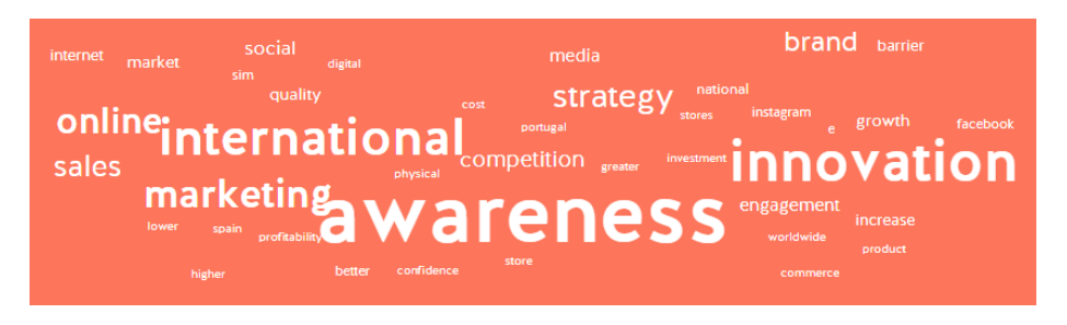
Table 4 - WordCloud

In the word frequency table, many other important words appear. Nevertheless, in this first one, more evidence was provided to those already stated, as they were able to demonstrate better what is expected to be achieved with the research.