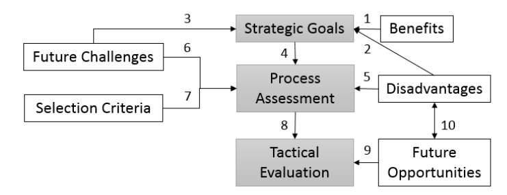
Figure 5. RPA Conceptual Model

A conceptual model provides a scheme with the relationship between major concepts (Järvelin and Wilson, 2003), facilitating the representation of knowledge in a non-ambiguous form (Schermann et al., 2009). Plus, conceptual models can be used to guide research by systematizing knowledge and mapping a fraction of reality (Bunge, 1967), therefore being appropriate for representing the main concepts around RPA and their relationships, as represented in Figure 5.