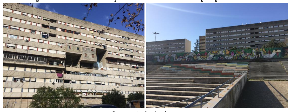
Figure 3 - Photos of the façade of Corviale from two perspectives

In the original project, the residential floors were interrupted in the middle by a "free floor" (as called in Fiorentino, 1974) that was dedicated for commercial services. The floor separated different residential types. On the upper floors, the houses are distributed by galleries and accessed through the five main staircases. The lower floors contain in-line houses that are connected by secondary staircases. The two typologies can be identified by the colours around the windows outside: red for the first ones, and blue for the second ones.