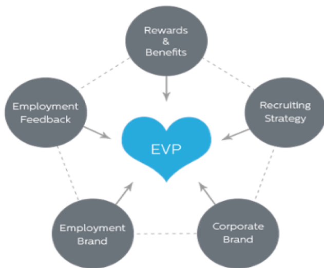
Figure 1: Variables of an EVP.

functioning, well-being of the employees and for obtaining results. There are variables associated with the value proposition, and all of them are crucial for talent to be drawn into the firm, and the existing ones remain. The organization must have well defined a recruitment plan, where it must be put in place to make the results visible. Concerning the corporate brand, it is also essential that it be well defined according to the organizational culture of the company. Also, employer branding is a strategy currently adopted by some companies that aim to stand out and remain in the market vis-a-vis competitors. The feedback given both internally and externally makes it possible for people to have a good perception of the organization.