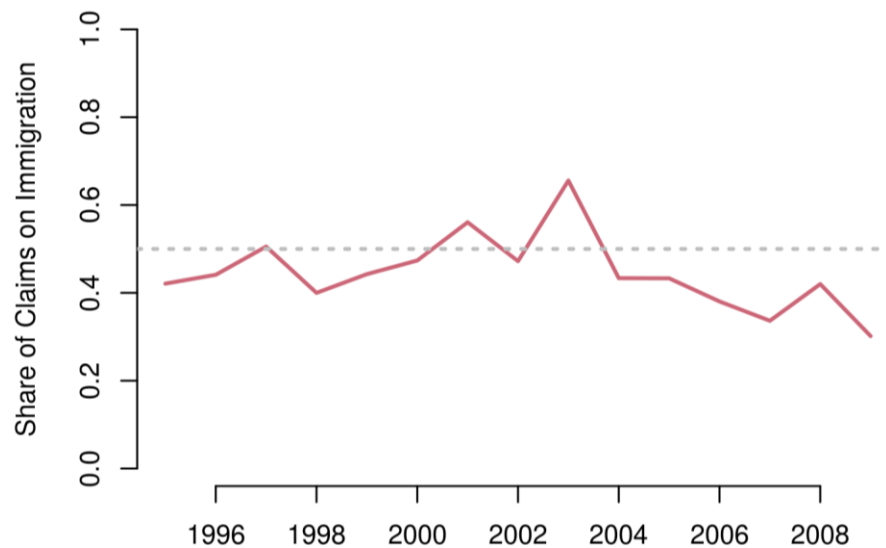
Figure 1: Share of claims by left-wing parties over time

Notes: The dashed line indicates 50% of claims; overall 57% of claims are made by right and centre-right parties, with 43% of claims being made by left-wing parties; see Table A1 and A2 in the appendix for the distribution by country and the distribution of different kinds of left-wing parties over time.