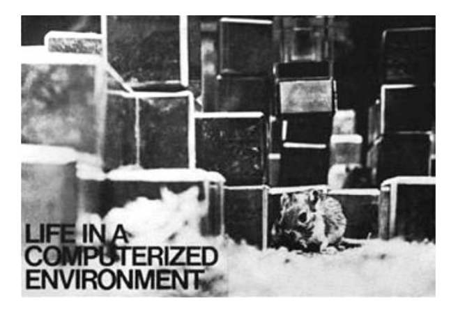
Figure 3: SEEK project / installation comprising a colony of gerbils in a 1.5 m x 2.4 m large glass "city", 5 cm blocks and a sensor-enabled robotic arm to change the habitat (Llach, 2015).

The next Negroponte / AMG project was the strangest of all but at the same time innovative at the interactivity level that achieved, and it was called SEEK. In the Kepes tradition, SEEK was a scientific research project that was also an art installation and was the Architecture Machine Group's contribution to the 1970 exhibition Software: Information Technology: Its New Meaning that took place at the Jewish Museum of New York, curated by Jack Burnham. The project would also be on the exhibition catalog cover (Llach, 2015; Scott, 2016; Wiesenberger, 2018). SEEK (Figure 3) consisted of another Blocks World domain that simulated a "city" planned to interact with its inhabitants and to be taught by them (Steenson, 2017).