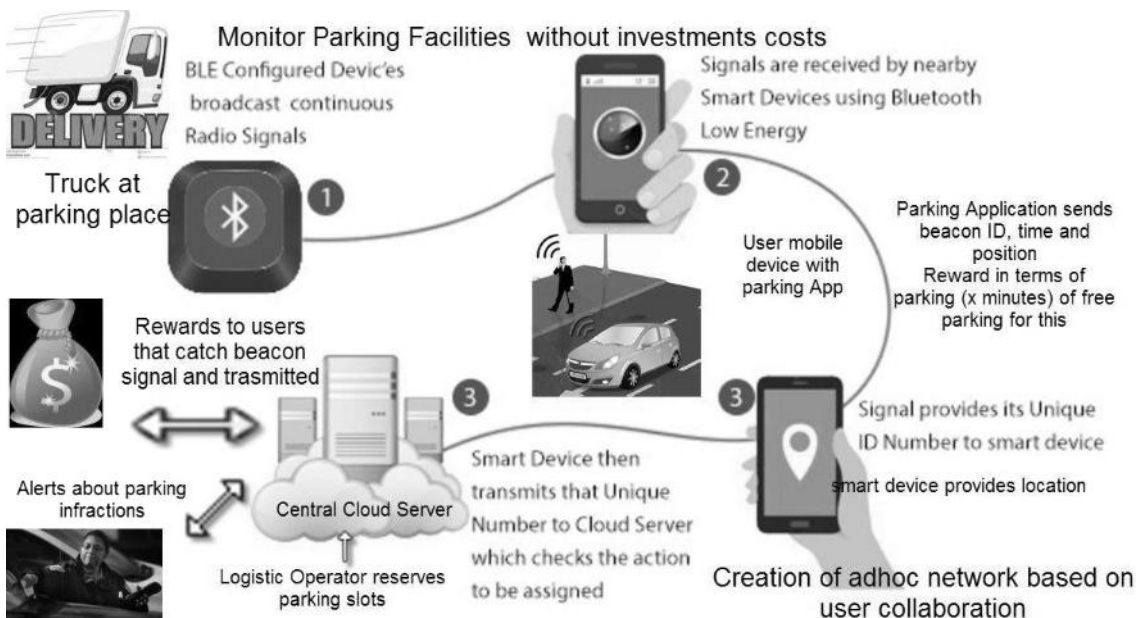
Figure 2. Overview of the proposed approach to create parking monitor facilities without investments costs using an ad-hoc network of user mobile devices in a collaborative process

The reservation system (available in web and mobile interface) sells slots of 15 minutes parking for the identified places, which logistics operator should reserve in advance. The mobile application gives guidance towards parking and alerts of traffic situations. Figure 2 shows the main working idea for the main system with beacon signals captured by mobile devices and truck position is added and transmitted to a central server. This information is proceeded to check if the parking was reserved or not. In order to avoid errors that can result from users receiving beacon signals from a moving truck passing in front of the parking place the system will wait from two notifications of different users before proceeding for infraction identification.