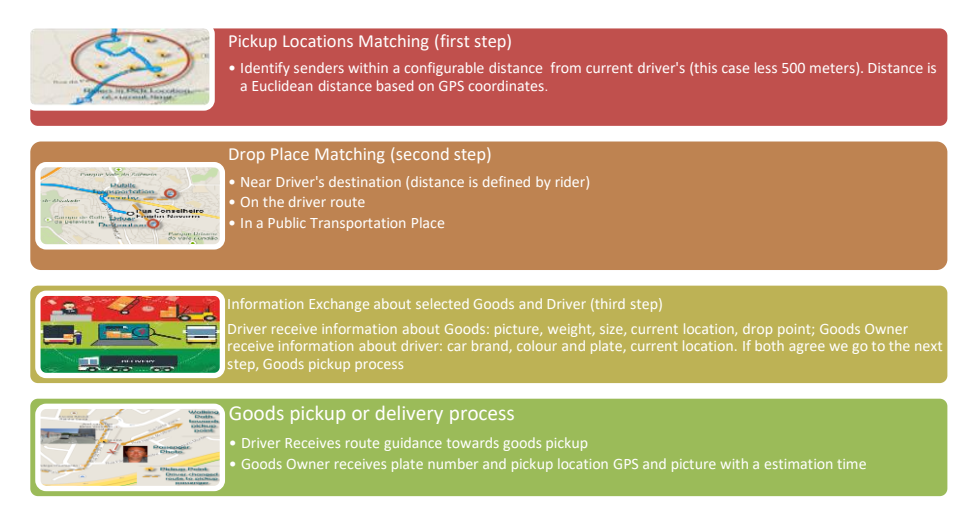
Fig. 4. - Flexible process to match drivers' route to sending and receiving locations.