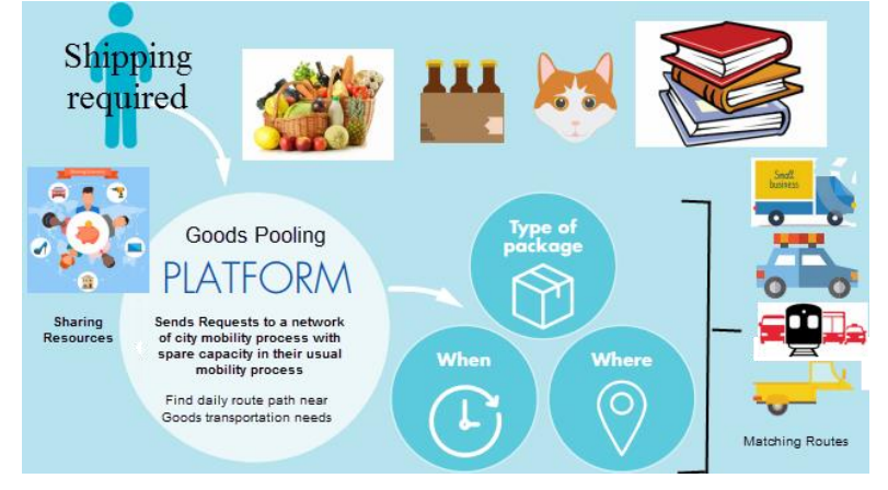
Fig. 1. - Concept overview of proposed system for goodspooling

A GoodsPooling platform guidelines and principles are illustrated in Fig. 1 overview. This platform registers drivers' routes and times through GPS sensor available in the majority of mobile devices and when there is a need for moving goods identifies potential drivers passing nearby in their daily mobility process. Based on distance the platform defines prices and manages the meeting process for pickup and delivery. All these processes allow real time information integration on mobile device application and mobile device sensors, like accelerometers and GPS. In addition, mobile communication allows users' connectivity on a permanent basis at lower prices. This conjugation of opportunities allows the possibility of dynamic Goodspooling with complementary real time information from traffic.