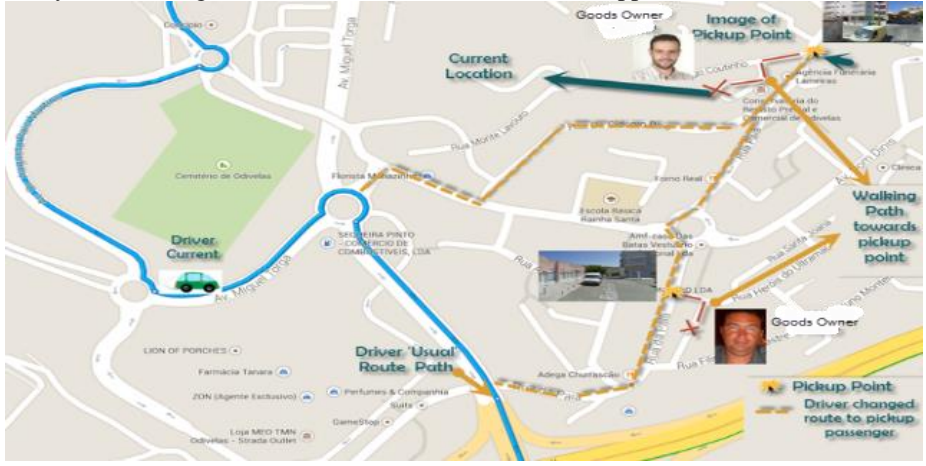
Fig. 5. – Example of a matching process result based on previous driver route and sender position

Based on sensor data, number of goods, it is possible to calculated the distance travelled with sharing goods transportation (Km), amount of fuel saved (from shared transportation) and CO_2 gas emission saved based standards patterns configurable (e.g average consumption of deliver van is considered as 8 liters per 100Km and 200g/Km of CO_2 ). It is possible to account the number of requests, number of offers, and the number of matches that have been done as well as other statistics in line with the ones presented for passengers/drivers. This process allows getting an overall monthly picture of how the system is being used and could be used as decision support.