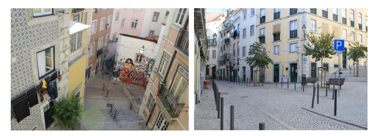
Figure 6. São Cristóvão: Sub-neighbourhood 5 – Described as the 'new' Mouraria (interviewee TR6).