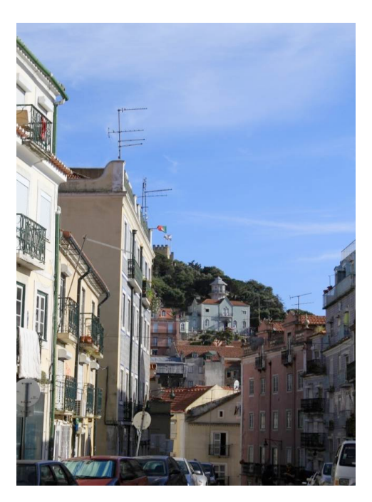
Figure 3 . Largo das Olarias: Subneighbourhood 2 – High concentration of traditional residents.