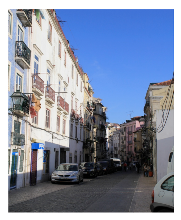
Figure 2 . Rua do Benformoso: Sub-neighbourhood 1 – High concentration of immigrants and their commerce.