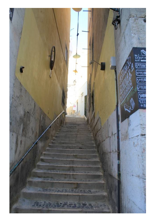
Figure 7. Beco do Rosendo: Sub-neighbourhood 6 – Considered one of the boundaries of Mouraria.