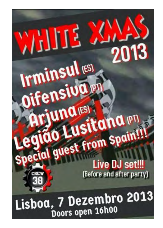
Figure 7: lineup of the 'White Xmas 2013' music concert in Lisbon

1970s, which created a transmissible musical heritage. Similarly, there was no previous musical tradition that could be co-opted and repeated, as happened in Spain where the lack of alternative music groups was overcome by repeating the songbook of the Falange by artists of the 1980s and 1990s. Finally, the protest music that rose during the democratic transition, and life on the underground by nationalist militants (which could inspire subsequent militants, as examples of tenacity and heroism), left no mark on the next nationalist generation.