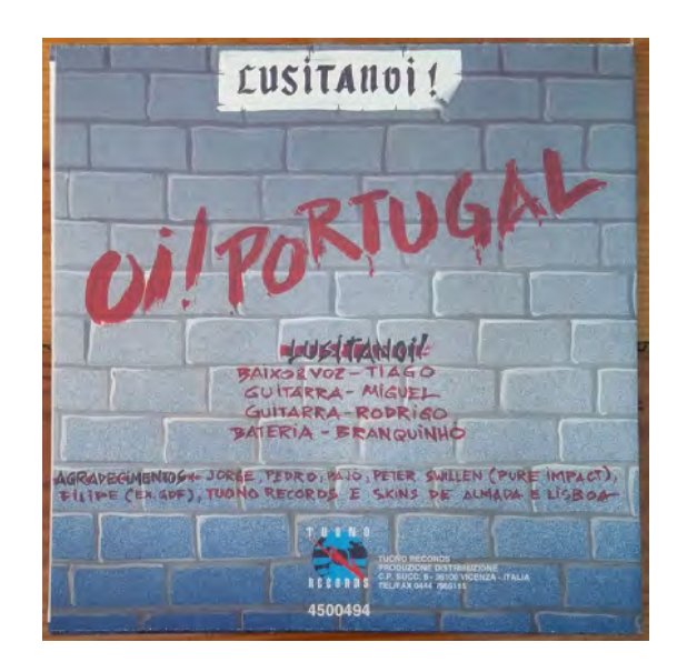
Figure 3: LusitanoOi EP EP Olho por olho, dente por dente

raided by the police in the early 90s. [...] Nowadays there are a lot of small parties that aren't as radical as the MAN or FDN. There is the National Alliance, the Right-Wing Nationalist Front and others (LusitanOi n.d.).