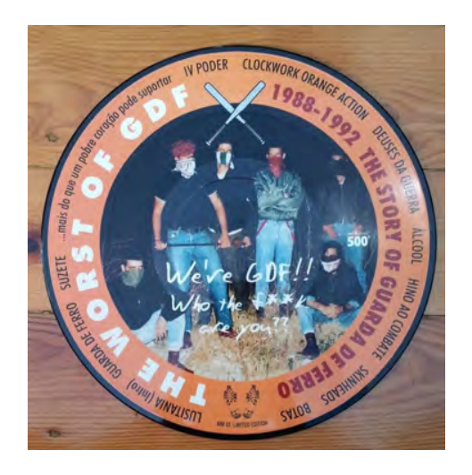
Figure 2: CD compilation of Guarda de Ferro

movement or a political party, and the prevalence of do-it-all militants. in practice limited the action of the Portuguese nationalist bands, who never wanted to take responsibility for musical events where there would for sure have been confrontations and clashes.