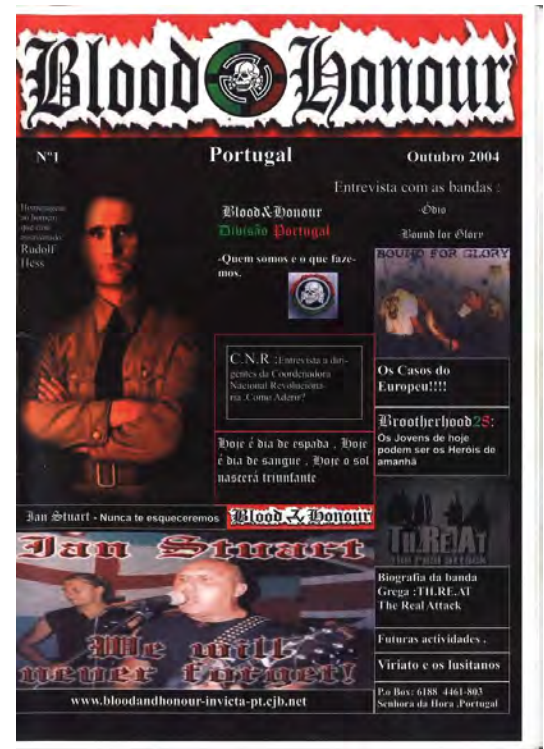
Figure 5: First issue of the skinzine Blood & Honour Portugal

in the technical improvement of its work and performance, and became the first Portuguese group to take part in many concerts at national and international level. The group pursued two goals: to increasingly integrate the transnational network Blood & Honour in order to play in Germany, Italy, England and the United States: and to escape the restricted circuit of the extreme right in order to compete in the commercial hatecore market.