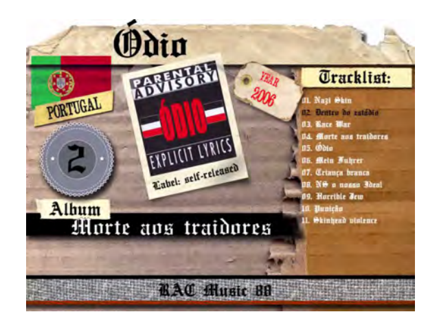
Figure 6: Album Morte aos traidores (Death to the traitors) by Ódio

Hammerskins music was also present in early years of the new PNR leadership, especially in concerts attended by a few hundred participants – in Lisbon South Bay in particular. In April 2007, the Juventude Nacionalista (Nationalist Youth – the youth organization of the PNR) promoted, on the fringes of the party conference Formas de Activismo na Europa (Ways of Activism in Europe), the joint music gig of Ódio / Bullet38 and the Spanish Asedio and Brigada Totenkopf (Rodrigues 2007).