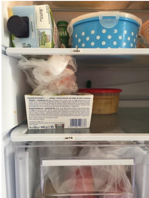
Fig. 3 - Managing refrigerator shelves

The common spaces (living room, kitchen, bathroom) also perform an important role in home sharing, since they are the place to hang out either with the co-inhabitants (as said, doing it in each other's rooms very rare) or with friends who come to visit. In fact, receiving friends (for an evening or for several days) and having parties is a major element to report in the home sharing abroad experience, resulting or in positive memories, or in some kind of conflict that one does not wish to remember.