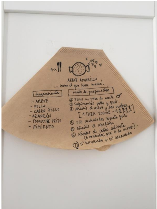
Fig. 01 - Sharing Recipes

Generally, youngsters leave their family homes (often for the first time) - characterized by lasting family ties, multigenerational occupation (at least two generations) and well defined social roles -, and face a whole new reality of co-existence within a level of supposed equality of domestic roles. The possibility of studying abroad implies, in most cases, an opportunity to achieve not only greater autonomy and independence from the constraints and family rules, but also to build a new self-identity as adults (Holdsworth, 2009). As the rules previously lived in family homes aren't applicable any longer, there is a need to create a new model for domestic life, with re-defined roles and rules.