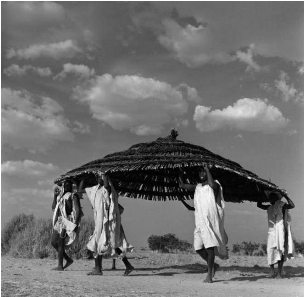
Fig. 02. Men leaving Kano market (Nigeria) carrying their latest purchase: a new roof for their house, 1951.