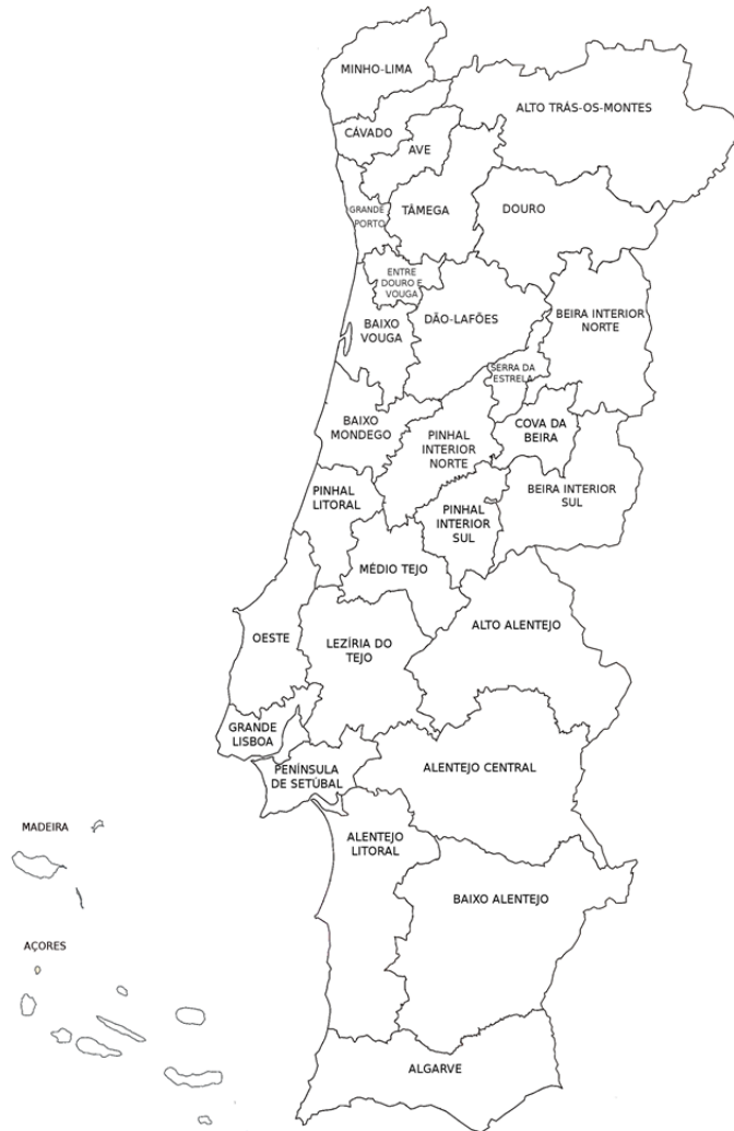
Figure A1 - Map of Portugal with NUTS III